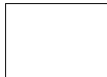
Photograph of the ward with self attested signature